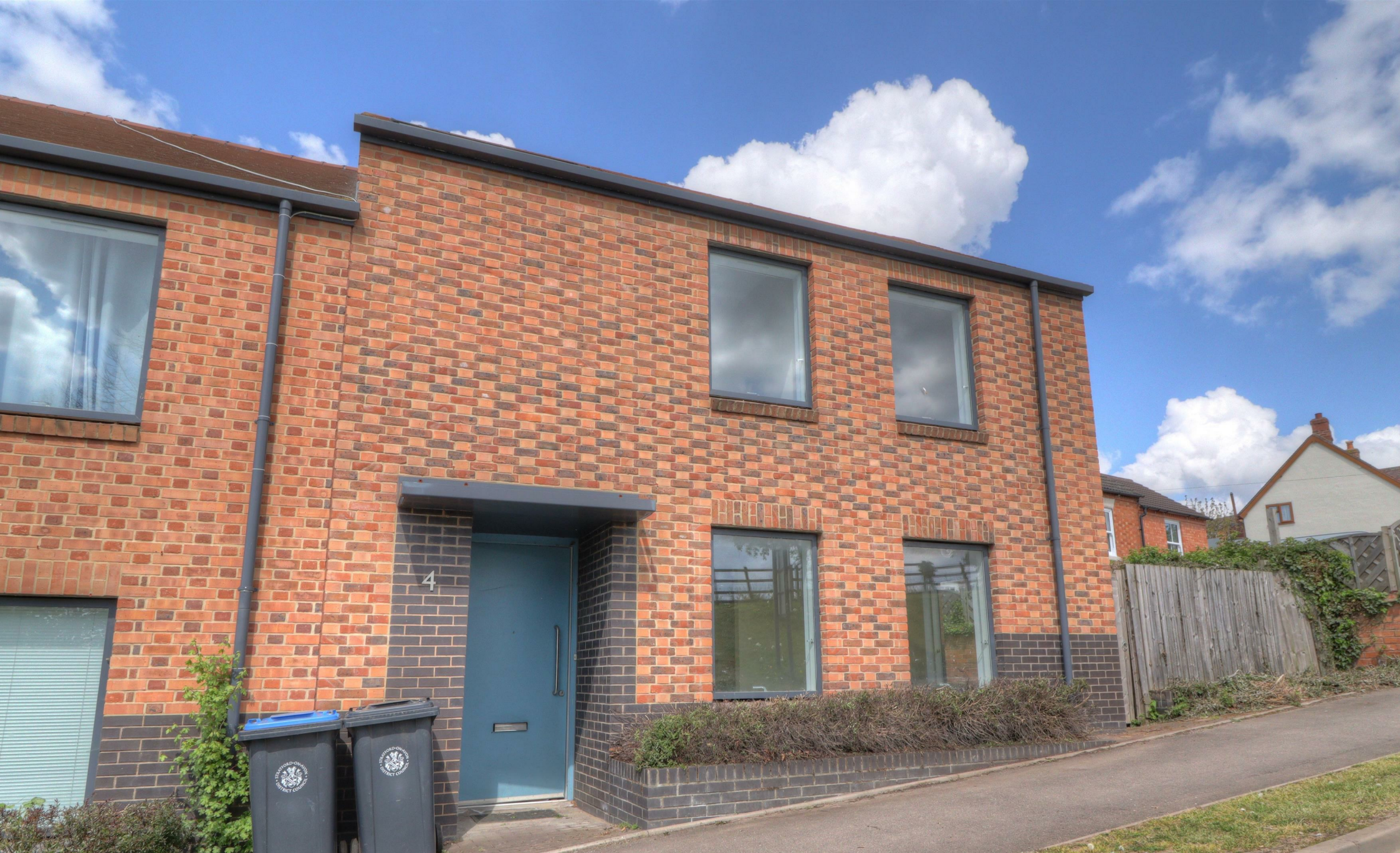
Plough Cottages, Bidford-On-Avon, B50 4DZ